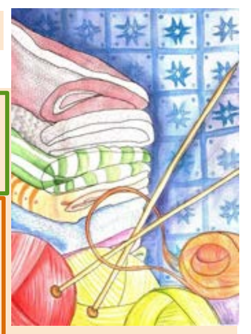
Art work by Mel Drury

In the Youth Hall Brunswick Uniting Church 212 Sydney Rd, Brunswick Enter from Merri Street driveway