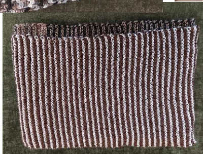
KOGO donations from last month's Olive Pesto Meeting