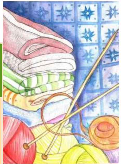
Art work by Mel Drury

In the Youth Hall Brunswick Uniting Church 212 Sydney Rd, Brunswick Enter from Merri Street driveway