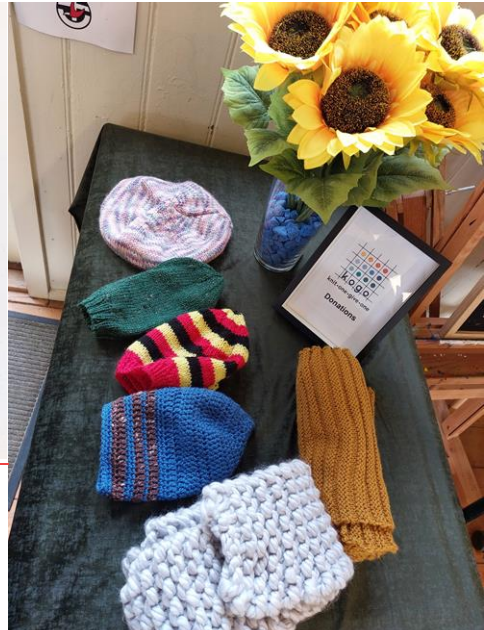
KOGO donations from last month's Olive Pesto Meeting