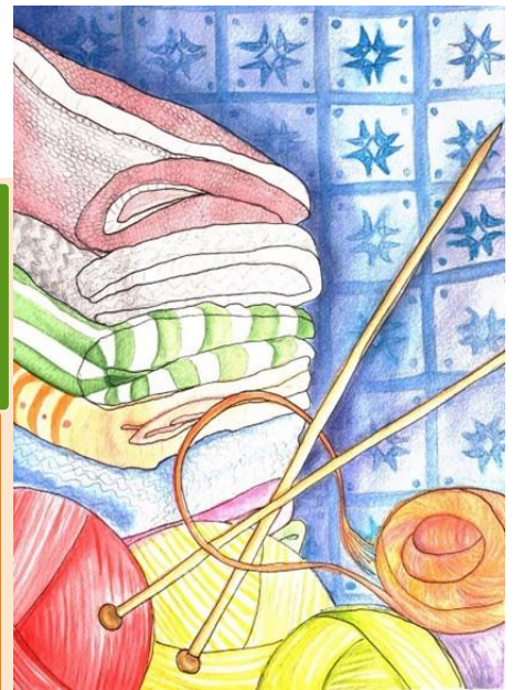
Art work by Mel Drury

In the Youth Hall Brunswick Uniting Church 212 Sydney Rd, Brunswick Enter from Merri Street driveway