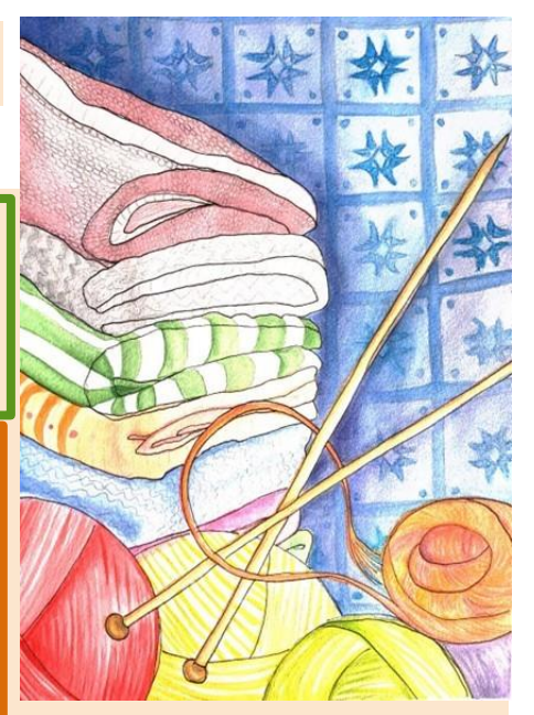
Art work by Mel Drury

In the Youth Hall Brunswick Uniting Church 212Sydney Rd, Brunswick Enter from Merri Street driveway