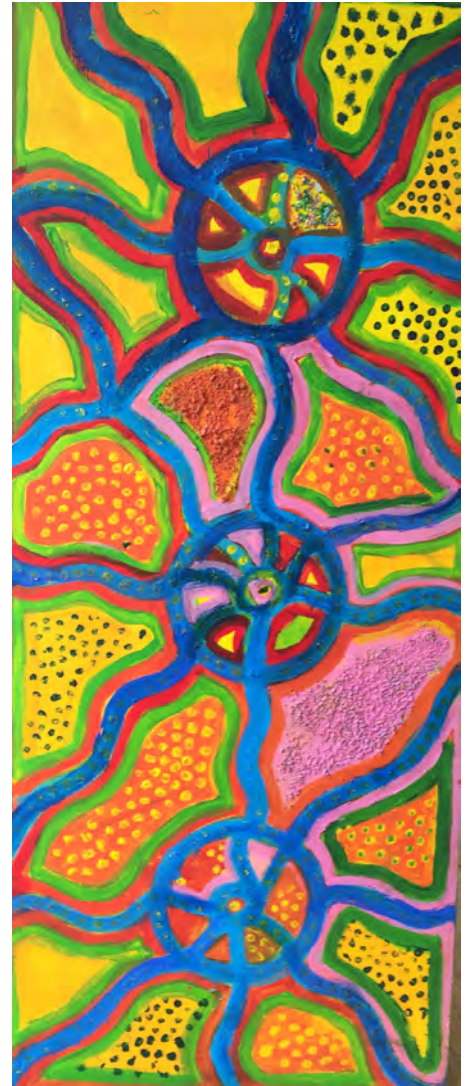
Untitled, by Giovanni