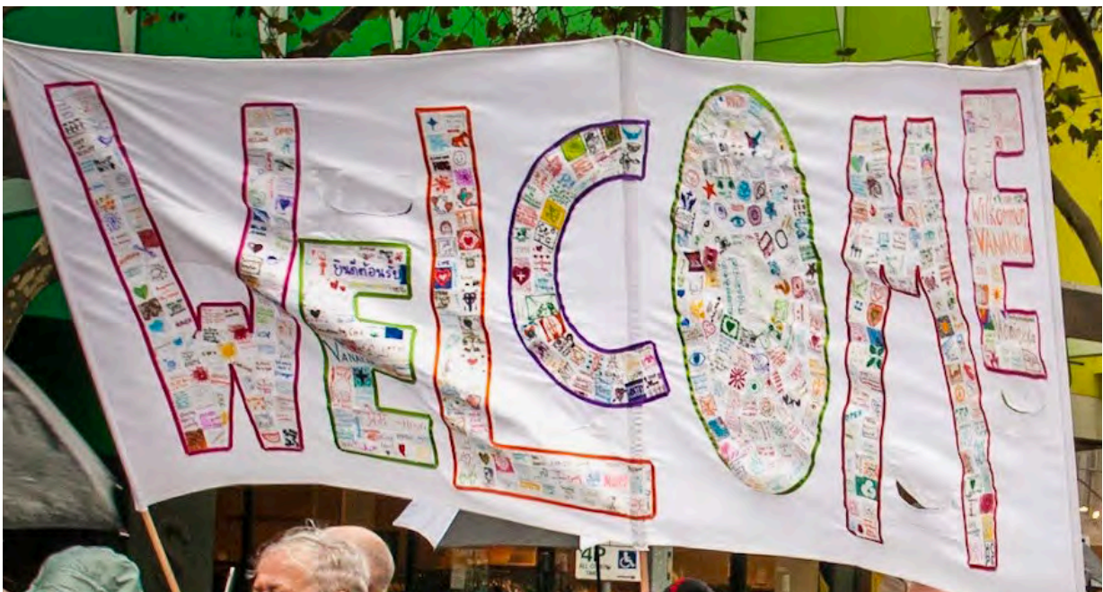
Welcome Banner, created for and during Lent worship 2017 used during Holy Week worship 2017 carried at Palm Sunday rallies