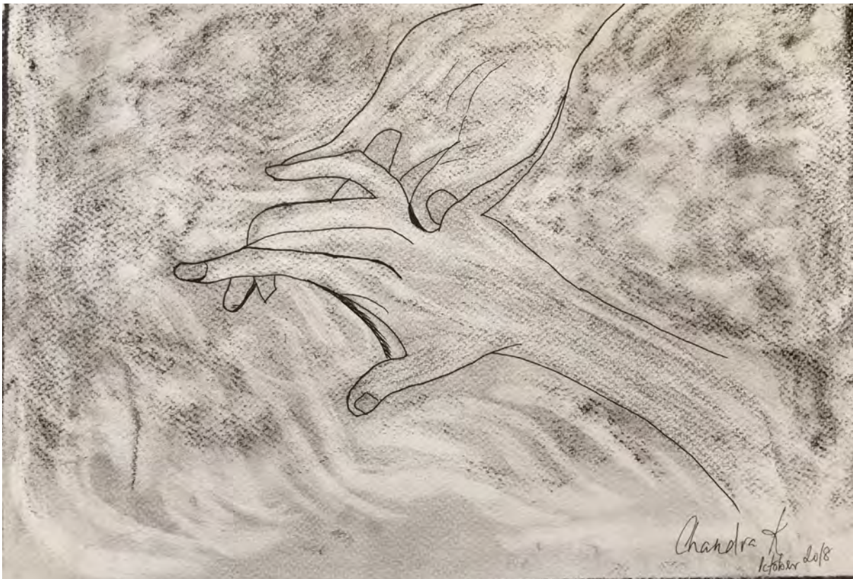
Untitled , by Chandra