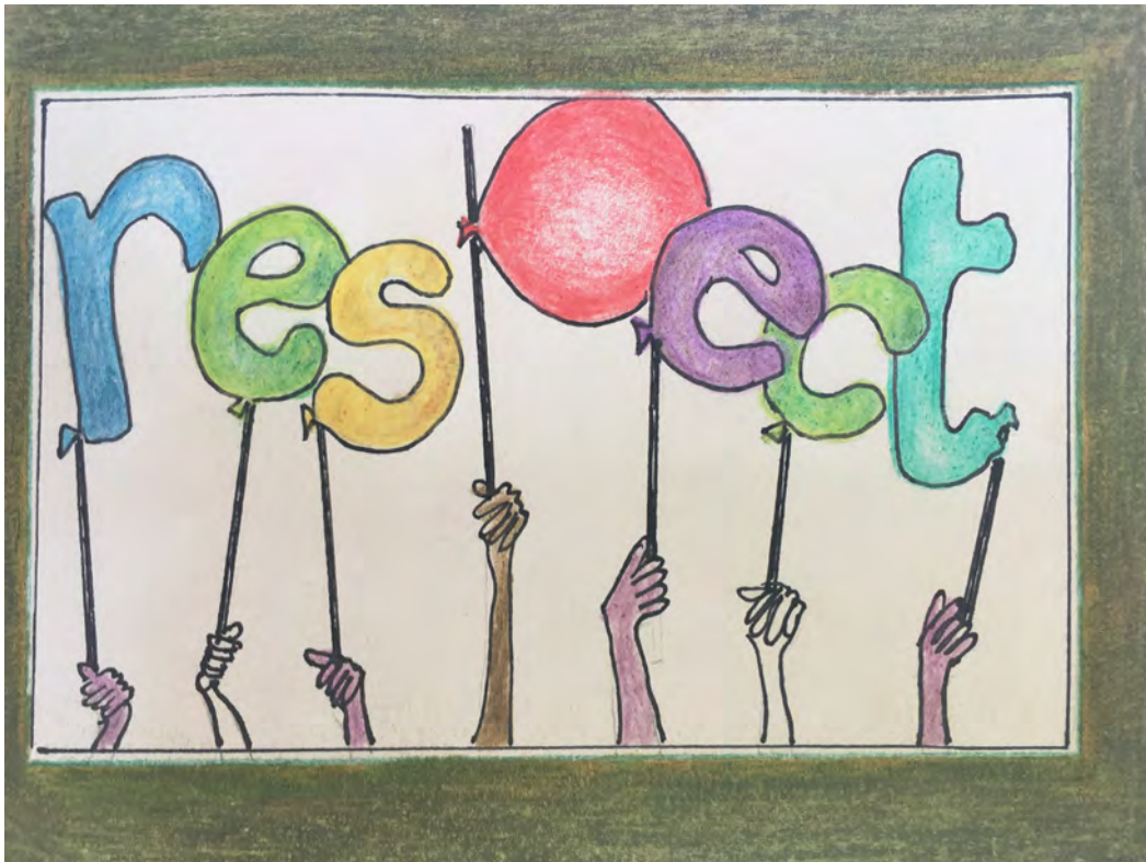
Respect, by Bev

It is important to note that disruptive behaviours do not seem to be out-of-hand and incidences of disruptive behaviour seem to be a relatively contained or minor concern. Nevertheless, the issue was consistently noted across the review. It was also noted (including a recommendation in response) as an issue in the 2015 Review, suggesting that issues around behaviour are a chronic problem for some of the people who come to services such as OW. However, it is important that negative behaviours don't become acceptable and it is also important that everyone who comes to OW feels safe, valued and comfortable.