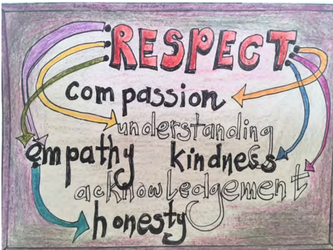
Respect, by Bev

OW is very well appreciated by guests but perhaps could be doing more. There was a general strong interest in more services and activities, including referrals, social work support, as well as more practical and recreational activities such as gardening, cooking, dancing. These need to be further investigated, tested and piloted and coordinated with other local service providers to avoid duplication and to learn from the successes and experiences of other agencies.