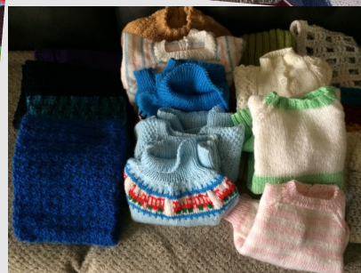
Lovely items for KOGO knitted by cheerful volunteer's.